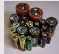
ALKALINE BATTERIES They're just garbage!