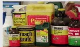
PESTICIDES AND HERBICIDES