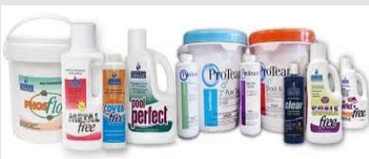
POOL AND SPA CHEMICALS