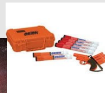
MARINE AND ROAD FLARES