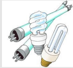
FLUORESCENT BULBS AND TUBES